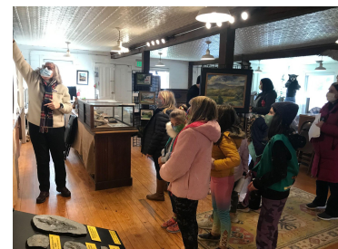
Girl Scout Habitat Badge at NHC