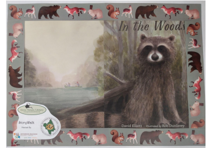
New educational children's stories @ park & trails every two months!