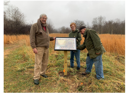
Rockfish StoryWalk Installed 12/30