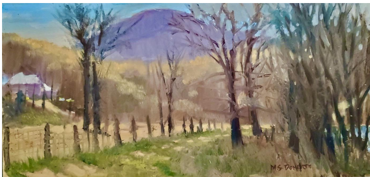
S. Rockfish Valley and 3 Ridges Mtn

There is a long tradition of outdoor painting - often called plein air painting - that in America began in the 19th century with artists exploring new frontiers. That tradition continues today with groups of artists painting during events organized to let local residents and art collectors observe the artists' individual responses to scenes that are very familiar to the community. This event in Nelson County will offer the same opportunity to be part of an informational celebration of all that makes our communities so special.