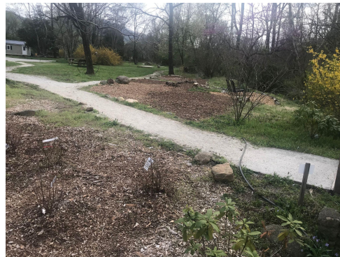
The beds are ready for perennial plants

SIGN UP: Send an email to Register@rockfishvalley.org with your name and when you can help. Let us know your interests, and we will let you know applicable tasks.