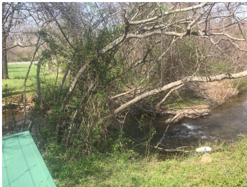
The vines have to go!

The native plant walk and Spruce Creek buffer are one of our important educational resources. You can work listening to the happy voices around you. You will know you are adding to their environmental education. Other times enjoy RVF resources and know that your volunteer tasks have collectively made it possible.